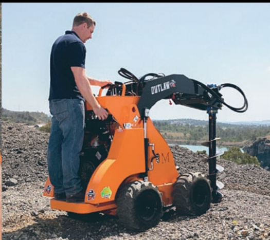
Large operators platform with curved fuel tanks to eliminate "hip bashing".