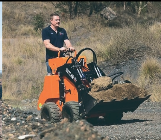
Clever weight distribution allowing for greater safe working loads and increased stability on rugged terrain.